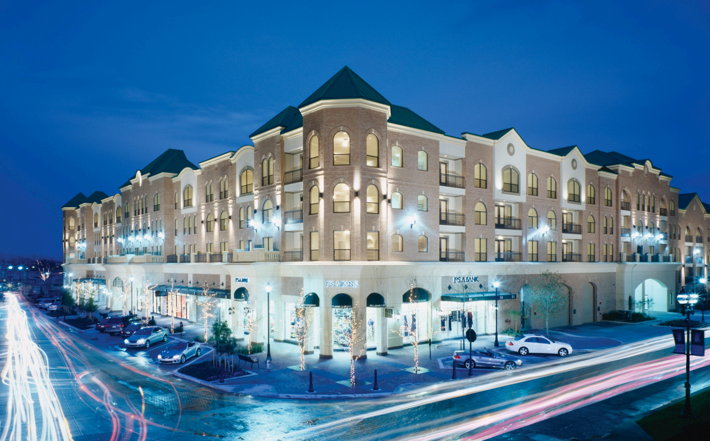
City Plaza at Town Square