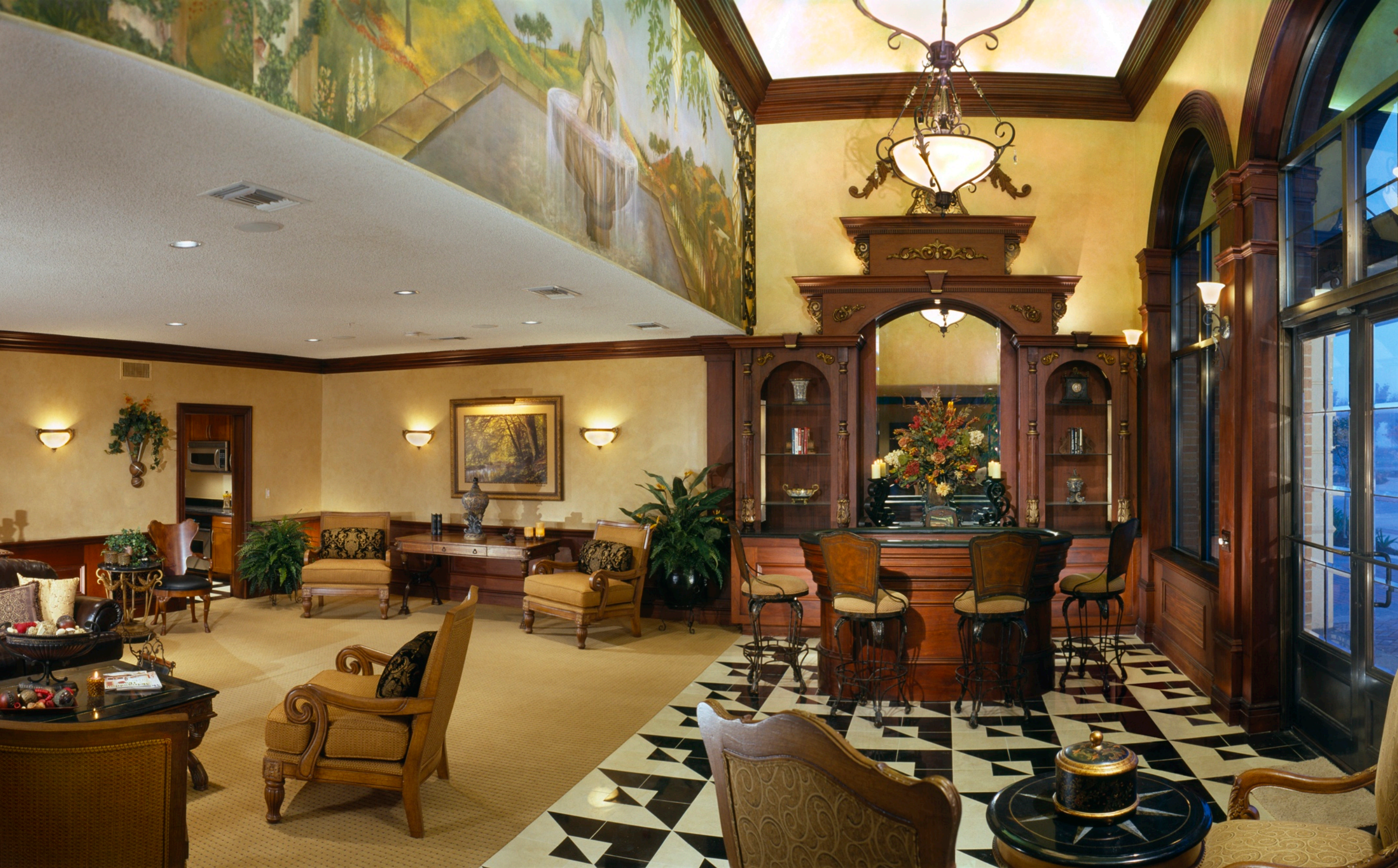
City Plaza at Town Square