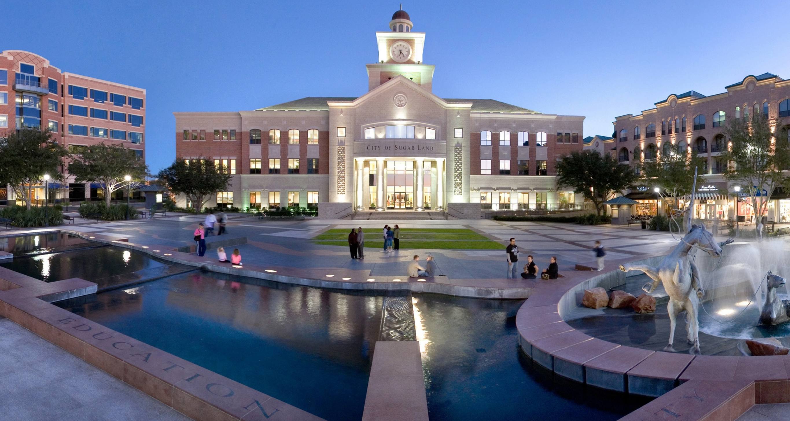
City Plaza at Town Square